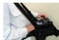
⑥-1 Working Belt in Action