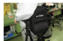
⑥-2 Working Belt in Action